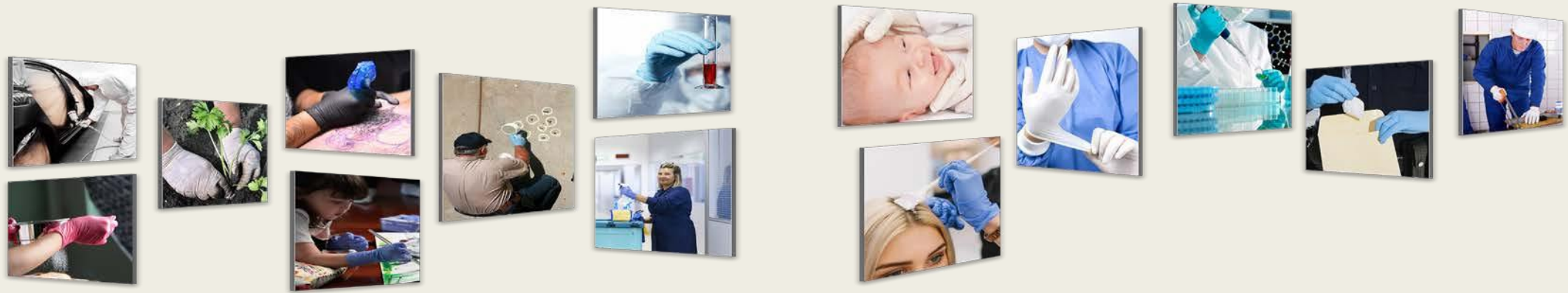
Medical & Dental